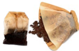
Coffee grounds, filters and tea bags