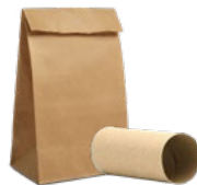
Paper bags and rolls