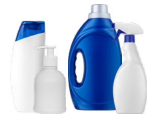
Shampoo, personal care, detergent, household cleaning containers (empty)