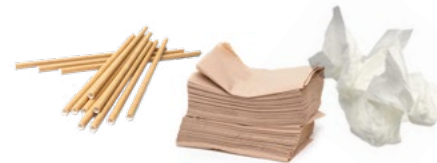
Paper straws, towels, napkins and tissues