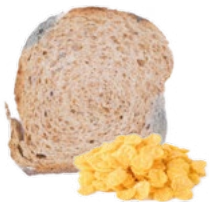
Breads and cereals