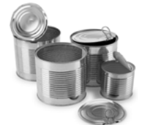
Food cans and tins (empty)