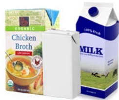
Juice boxes, soup and milk cartons (no straws)