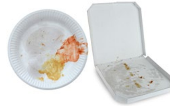
Food-soiled paper plates and cardboard