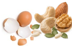
Nuts and shells