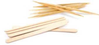
Stir sticks and toothpicks