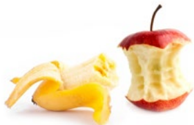
Fruits and vegetables