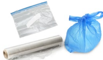
Plastic bags, packaging and wrap