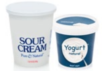
Food containers (empty)