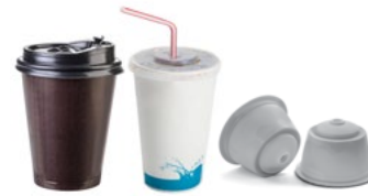
Take-out cups, straws, lids and coffee pods