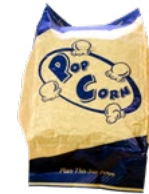
Microwave popcorn bags