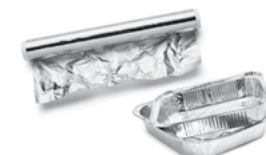
Aluminum foil and trays (empty)