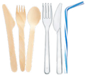
Disposable cutlery and straws