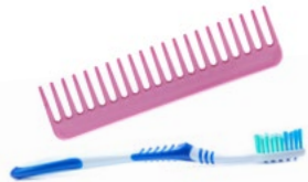
Personal care items