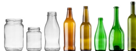
Bottles, jars and lids (empty, lids removed)