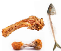
Meat and bones, fish and seafood