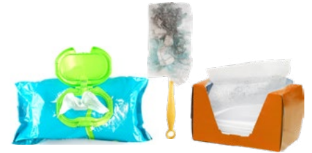
Wipes, mop and dryer sheets