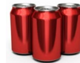
Aluminum cans (empty)