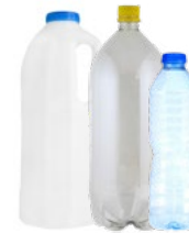
Pop, water bottles and jugs (empty, lids on)