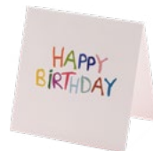
Greeting cards (no decorations)