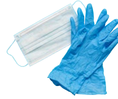
Single-use masks and gloves