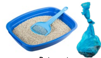
Pet waste (including cat litter)