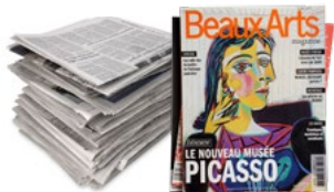
Newspapers and magazines