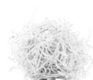
Shredded paper (small amounts)