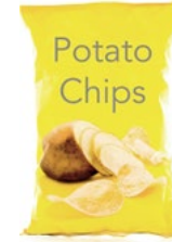
Snack wrappers and gum