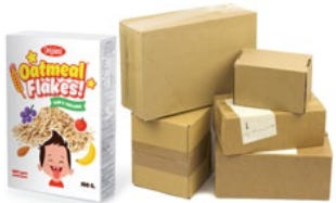
Cardboard, boxboard and frozen food boxes (no liners)