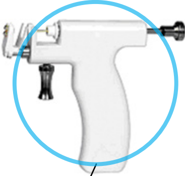
Ear piercing gun

These items are cleaned and disinfected or sterilized between clients: